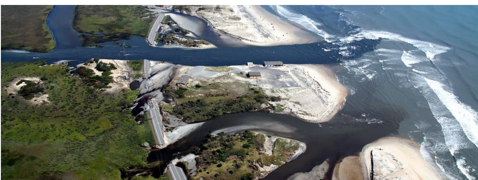
Hurricane Irene damage at Pea Island NWR.